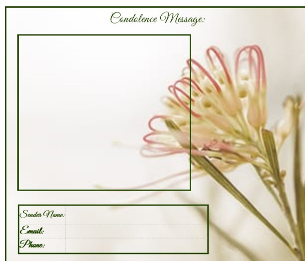
Sample of Condolence Message placed in back of Memorial Book for family